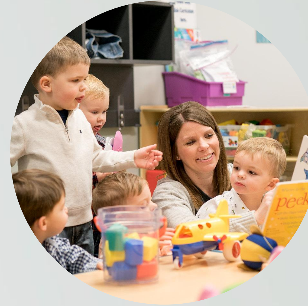
Arm in Arm Serving the Lord