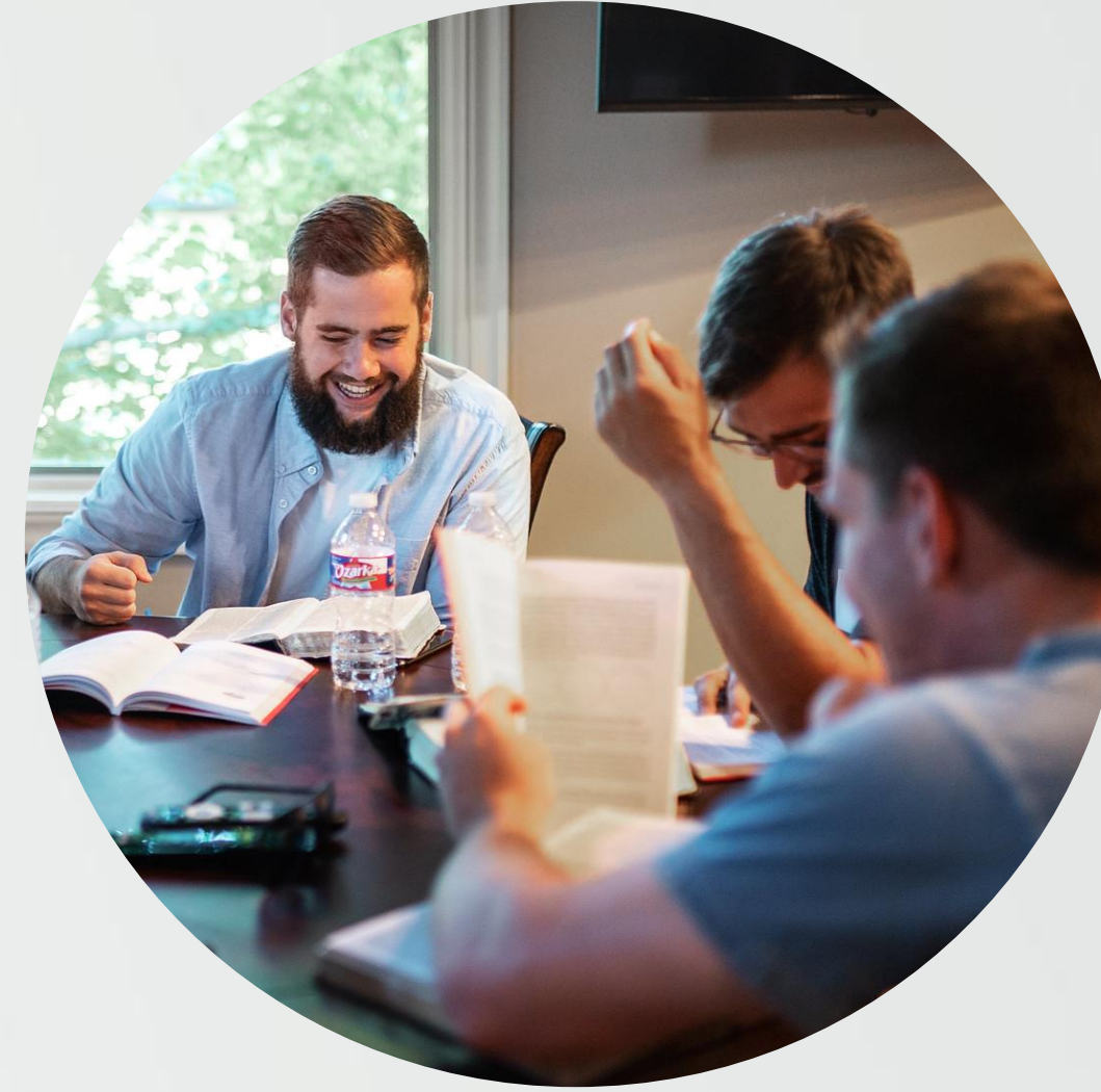
Face to Face In Small Groups