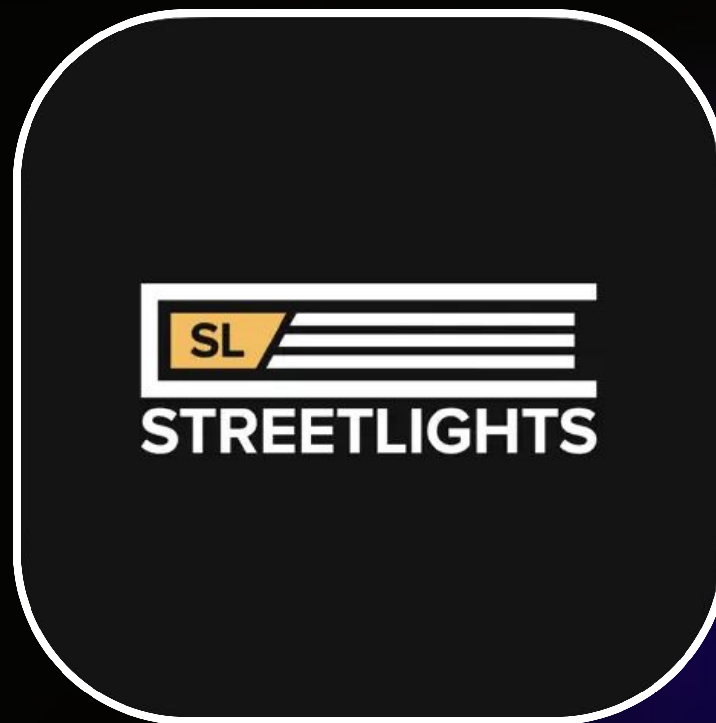
Streetlights Audio Bible App